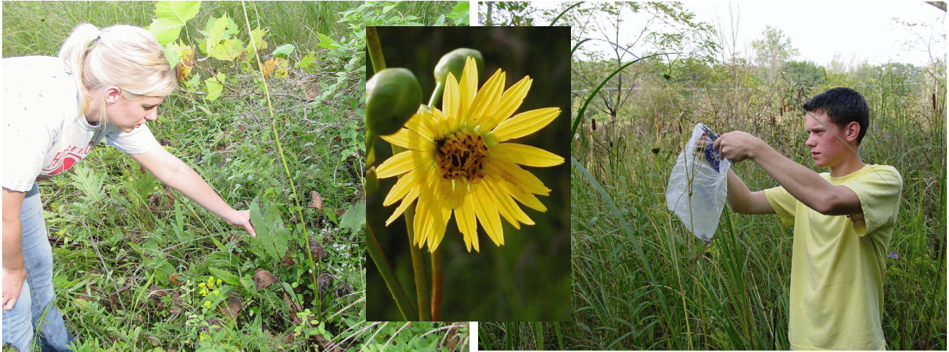
Collection of Achenes from Wet Prairie Remnant Near Xenia, Ohio October 2, 2005