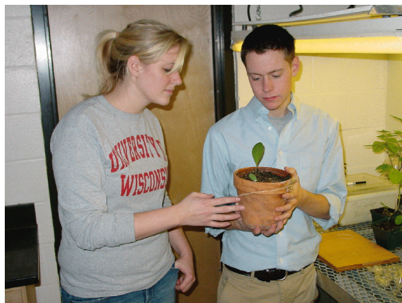
Young Seedling Establishment Plant Growth Lab Winter, 2005